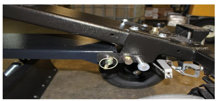
(Snow Blade locked into the Aerator Front Frame)

Snow Blade is now connected to the front of the traction unit. Shorten Ball Swivel Linkage to allow Snow Blade to raise higher than the Aerator head (do not need 3-4" of down force pressure, just approximately 1/2" to 1") for better clearance when transporting. Once Ball Swivel Linkage is shortened, turn bottom Ball so that the hole is facing to the front and back of the unit ( pictured below ). Start the unit and push hydraulic lever to bring the Ball Swivel Linkage down to Snow Blade Frame and line up in the slot. Insert pin with a spacer on the backside as well as on the front side and pin ( pictured below ).