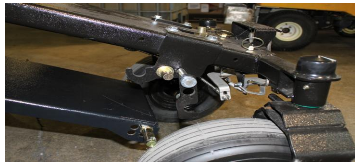
(Snow Blade Front Frame resting on Front Tire)

Once the traction unit is free of any attachments (in the under carriage area), slide the Snow Blade under the unit with the frame Draw Pins facing forward. Rest Draw Pins on front tires ( pictured below ) and re-position yourself in the front of the traction unit. Lift Draw Pin up into Front Frame Bracket and lock with Lynch Pins ( pictured below )